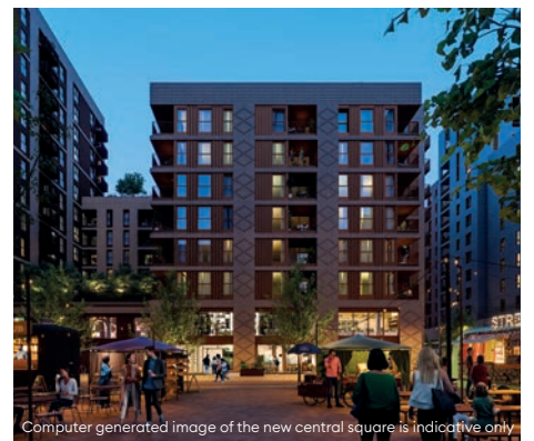
Computer generated image of the new central square is indicative only