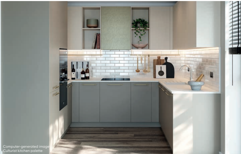
Computer-generated image Culturist kitchen palette