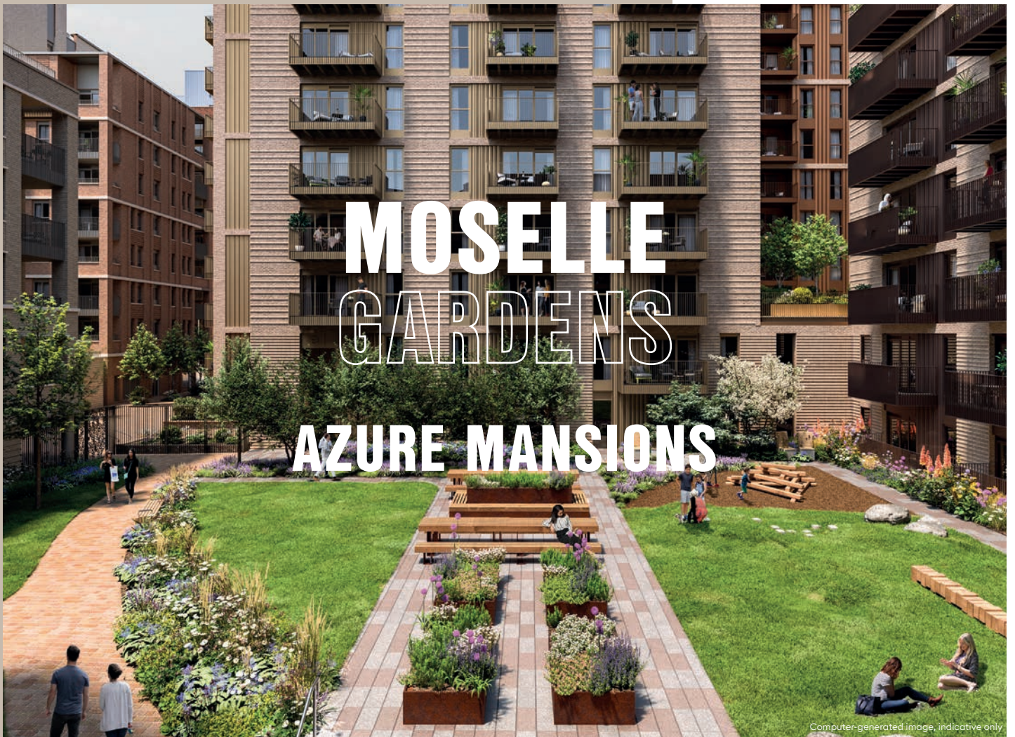
Computer-generated image, indicative only