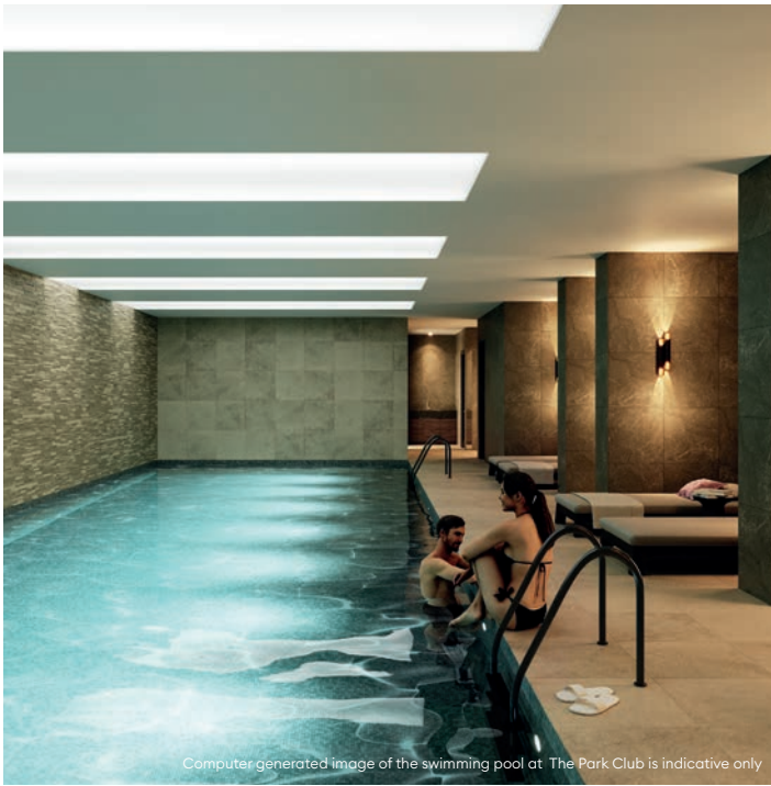
Computer generated image of the swimming pool at The Park Club is indicative only