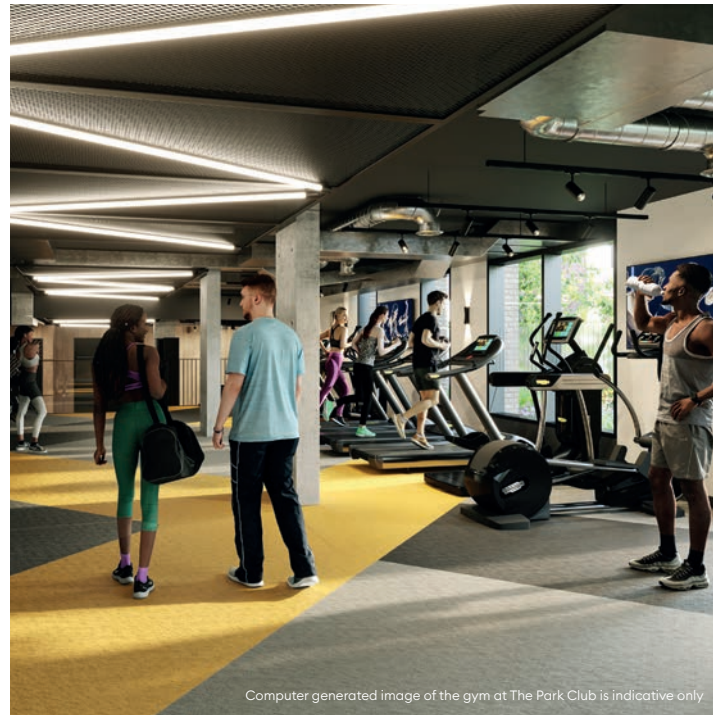
Computer generated image of the gym at The Park Club is indicative only