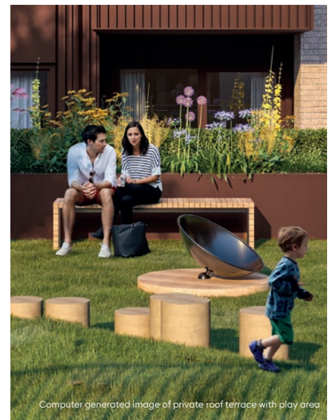
Computer generated image of private roof terrace with play area