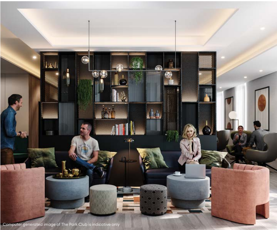
Computer generated image of The Park Club is indicative only